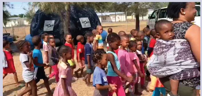
Learners of the Mokgandi Thlabanelo Senior Secondary School participated in the piloting of the Mobile Planetarium.