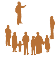
The Rössing Foundation